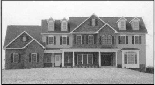
Actual view from the lots!